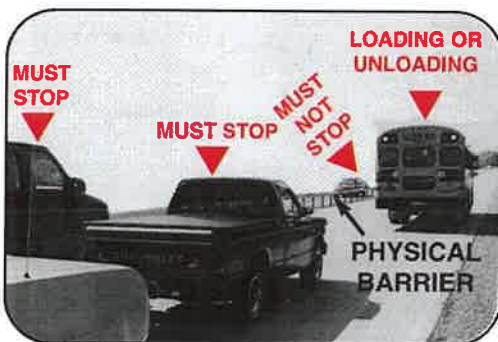
Physical barriers include concrete median barriers, metal median barriers, guide rails, etc.