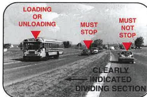
Clearly indicated dividing sections include trees or shrubs, rocks or boulders, a stream, grass, etc.